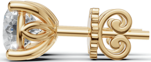
Celestia Crown Studs