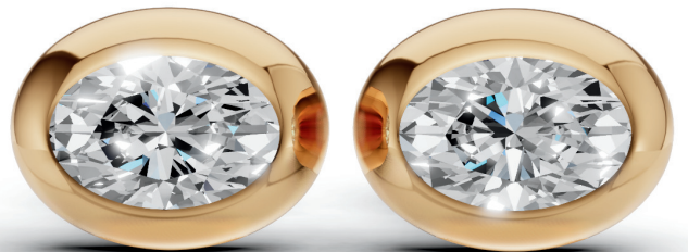
Solaris Bezel Studs