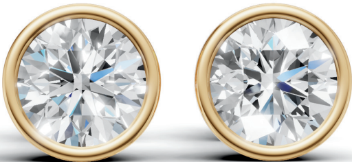
Luna Bezel Studs