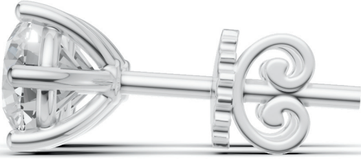
Eterna Crown Studs